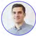
Iacob CEO and CTO